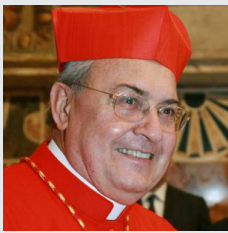
Commission on Lebanon and the Middle East Cardinal Leonardo Sandri