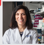
Dr. Huda Y. Zoghbi Friday AM Scientific Advances and Their Impact on Health and Society