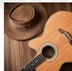
Country and Western Music and Dancing Friday Night